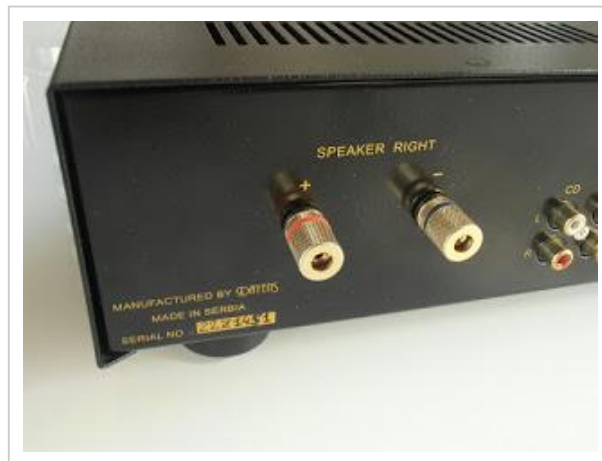
Large speaker terminals