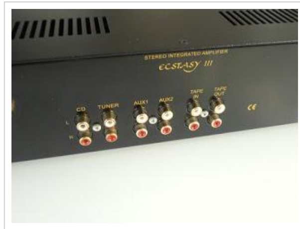
Four pairs of line-level inputs and one tape loop