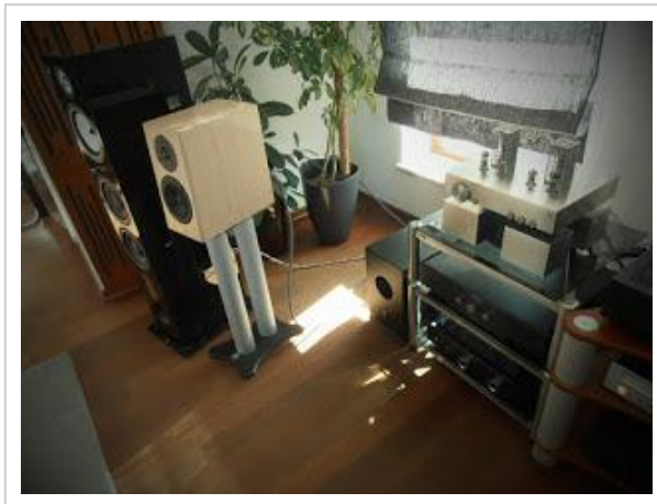
Monitors that Studio 16 Hertz Canto Three SE