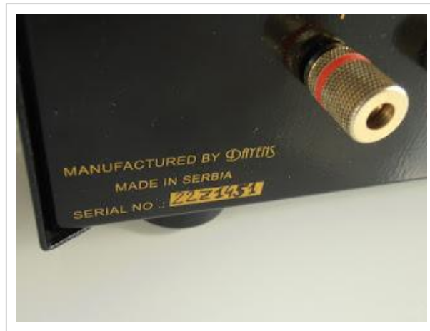
Made in Serbia!