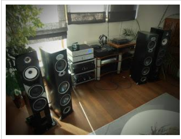
Test Kits - This column Esprit Triangle Antal EZ and Polk Audio RTi A7