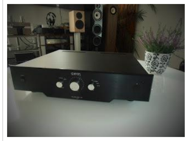
Cost-effective design; a little old-fashioned, but pleasing to the eye

What is in the middle, this can be easily read and see on the Internet. A mounted there much good. Have a look at the pictures of the interior. Meanwhile, I come to the most important, that description sound experience.