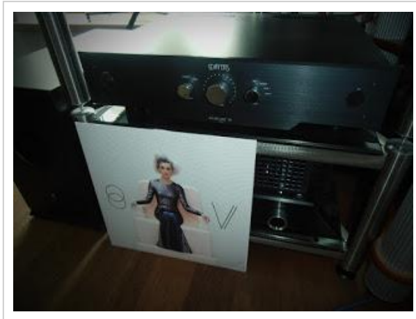
The test described in the text of vinyl St. Vincent "St. Vincent" - recommended!