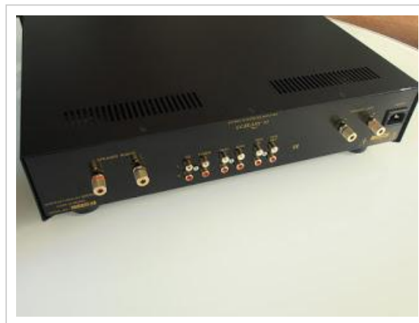
Logic jacks on the rear panel; speaker terminals on both opposite ends