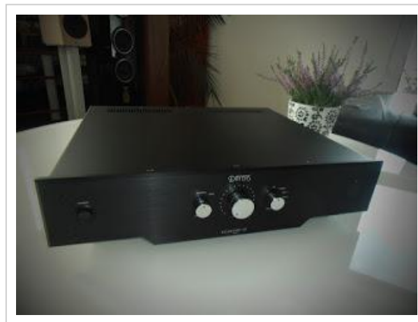
In the middle knob to strengthen, to the left knob to select the source-tape recorder, right - selector sources